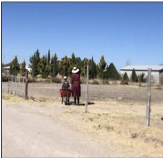
Figure 9: Two LGS Mennonite children in a colony in Mexico.

LGS Mennonites are often impacted by the many cultural differences that exist in Ontario compared to life in colonies in Mexico, Central or South America. Colonies are much more homogenous—most people share similar beliefs, values, and cultural background, even when a diversity of churches or traditions is present. In Ontario, LGS Mennonites settle in established communities with a diversity of people, who have a variety of beliefs, values, and cultural backgrounds. At the same time, LGS Mennonite newcomers encounter dominant Canadian norms and values that may differ, or even conflict, with their own. (For example, Canada tends to be an individualistic society, where the needs and wants of an individual are valued over the needs and wants of the group).