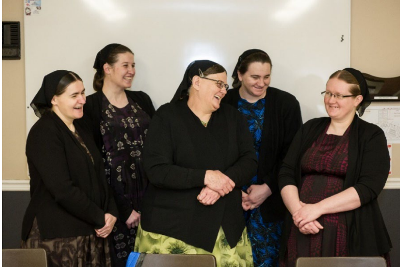
Figure 4: A group of LGS Mennonite women in Aylmer, ON. Here you can see an example of the head covering commonly worn by many LGS Mennonites. Young girls may wear a white kerchief. Women, once baptized or married, wear a black kerchief.