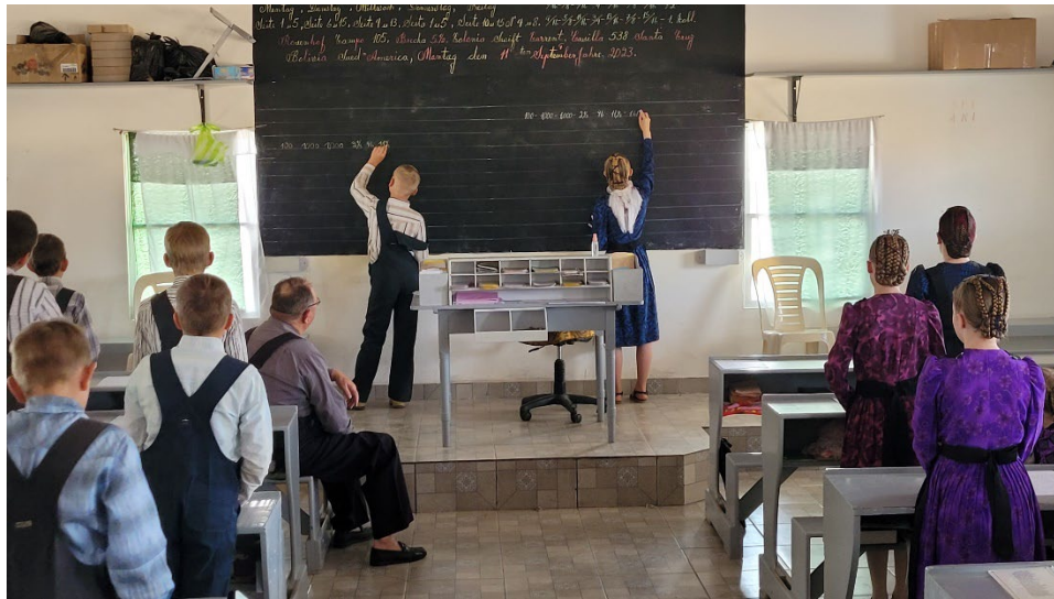
Figure 12: A traditional colony school in Bolivia. Here you can see the boys sitting on one side of the class and the girls on another.

interpreted as a sign of distress, so a lot of value is placed on caring for their families and households.