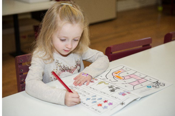
Figure 15: A young LGS Mennonite student.