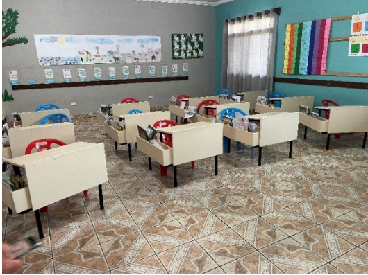
Figure 14: A more modern-style school in a LGS Mennonite colony.

Although, there does seem to be a growing value for education that is necessary to obtain certain jobs, like trades training. Alternative high school programming has been successful in meeting the needs of LGS Mennonite students, emphasizing hands-on learning and work experiences and offering more flexibility in schedule.