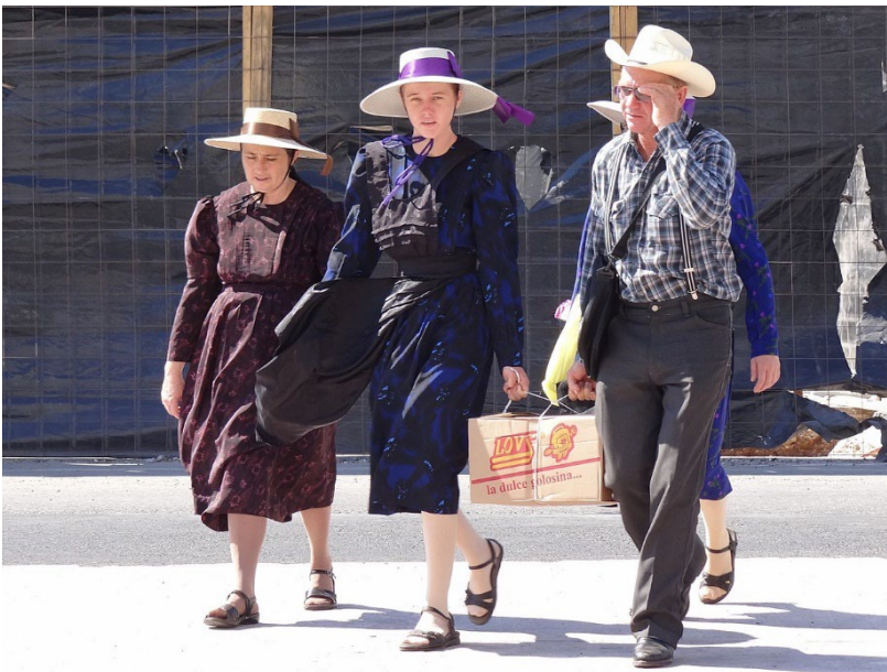
Figure 3: Low German Speaking Mennonites in Campeche, Mexico. You can see the differences in dress compared to the Amish, including patterned dresses and shirts and different style hats. Men will also wear baseball hats and women will wear kerchiefs. LGS Mennonites in southwestern Ontario also do not use horse and buggies.