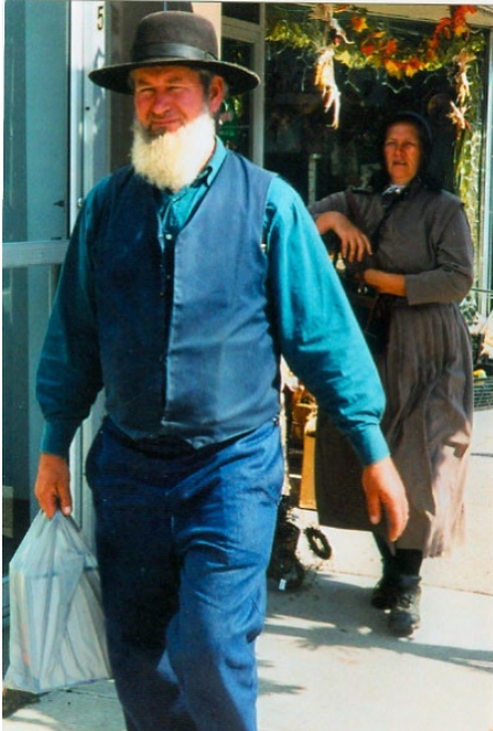
Figure 2: An Amish Family in Aylmer. The Amish in the area are sometimes identifiable by their bonnets for women (whereas LGS Mennonite women wear kerchiefs as a head covering), beards and wide-brimmed hats for men, solid-coloured clothing, and use of horse and buggies.