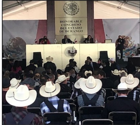
Figure 10: LGS Mennonites marking the 100 th anniversary of their settlements in Mexico (1922-2022).