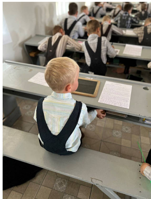
Figure 13: Boys at a traditional colony school in Bolivia.

Because many LGS Mennonites value being able to work, some students will choose to leave high school to start work. Younger children may also miss school at times to help their family.