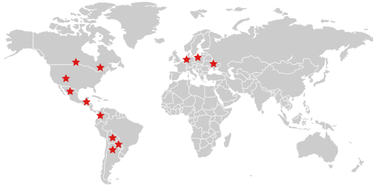
Figure 5: LGS Mennonite settlements throughout history.

The following timeline outlines the series of migrations that Low German Speaking (LGS) Mennonites have undertaken since their formation in the 1500s. However, it's important to understand that, like any large group of people, this does not represent the path that every LGS Mennonite took over the centuries. During every mass migration, some LGS Mennonites remained. Nonetheless, many LGS Mennonites did follow this exact path, particularly the LGS Mennonites who are now settled in southwestern Ontario. Often, mass migration occurred when authorities began forcing LGS Mennonites to go against one of their core beliefs. This history of migration to preserve their life and values deeply shapes LGS Mennonite culture today.