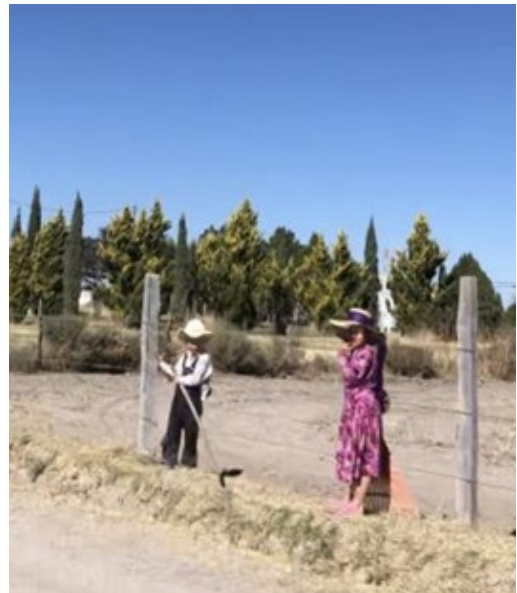
Figure 1: Two Low German Speaking Mennonite children in Mexico. This is an example of clothing worn by many LGS Mennonites.

Today, there are approximately 60,000 LGS Mennonites living in southwestern Ontario. They make up part of our rich and diverse communities.