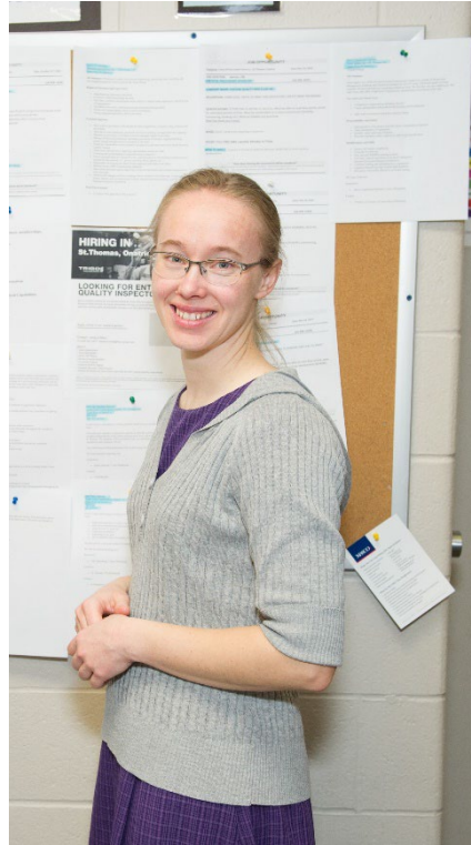
Figure 7 (left): An LGSM woman at Mennonite Community Services in Aylmer, ON.