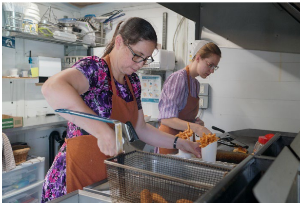
Figure 16: Two LGS Mennonite women working in a food truck.

Generally, LGS Mennonites place a lot of value on working to support their families and communities. Work is seen as something manual or physical; there is generally less of a need for white-collar type jobs in LGS Mennonite colonies, and these jobs are often accordingly not as highly valued. Historically, LGS have valued agricultural work as a means to self-sufficiency and supporting their community. When choosing a place to settle, access to land to cultivate was often an important consideration. LGS Mennonites have also historically been very good at cultivating productive agricultural land, even in harsh conditions. Agricultural work continues to be very important to many LGS Mennonites, both in colonies and in Canada; however, poverty, land shortages, droughts, and other challenges mean that self-sufficient agriculture is not a reality for every LGS Mennonite family.