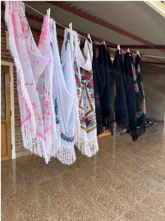
Figure 6 (above): Traditional LGS Mennonite head coverings. This type of head covering is often worn by LGSM living in colonies.

Many LGS Mennonites prefer to simply leave or not engage when faced with conflict, or a potential conflict. As a service provider, this may be particularly confusing or challenging if an LGS Mennonite client simply ends the relationship and stops accessing your service without any prior indication of an issue. LGS Mennonites often prefer to leave than to risk offending you as a service provider. Again, this characteristic is often a result of LGS Mennonite history and pacifist values, where, historically, an effective solution to persecution, discrimination, or conflict was to move to a new place.